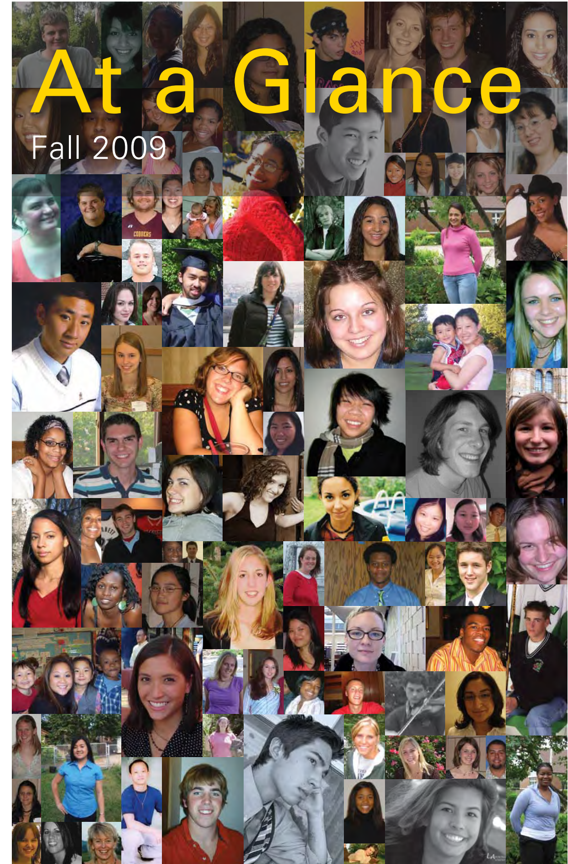
COVER: Current students and recent graduates who have received Minnesota Private College Fund scholarships.